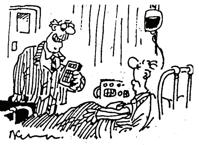
"I'm not Dr Jekyll – I'm Mr Hyde the accountant"

To achieve these benefits, the estimates are that the CCGs would have to spend between £48.6 and £60.8 million (a variance of 25%). This, we are told, might leave a net benefit by 2018-19 of anything from £21.6m to £74.9m (a variance of 250%,